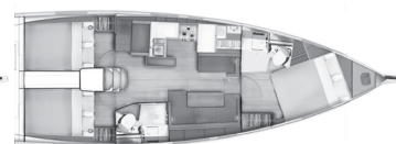
Version D Forward Owner's cabin 2 aft cabins / 2 heads