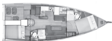
Version B Forward Owner's cabin 1 aft cabin / 2 heads