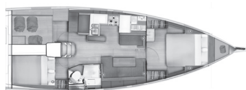
Version A Forward Owner's cabin 1 aft cabin / 1 head (Dressing + furniture with private sink in forward cabin, in option)