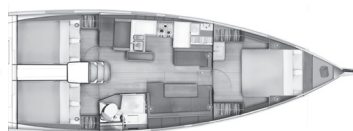
Version C Forward Owner's cabin 2 aft cabins / 1 head (Dressing + furniture with private sink in forward cabin, in option)